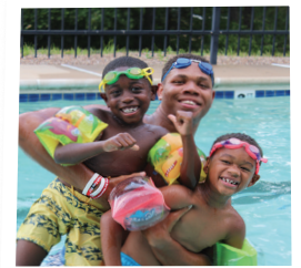
FUN, FAITH, AND FOREVER FRIENDS